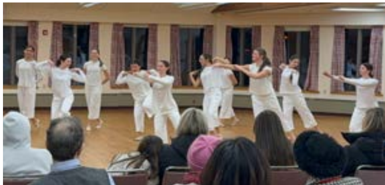
Jenks Center Holiday Performance