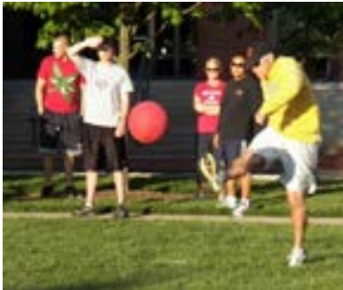
263 Main Street, Winchester MA

Date: Sundays September 15 - November 3 Time: 12:30PM-2PM Location: Ambrose Field Cost: FREE, but must register online or by calling rec. dept.